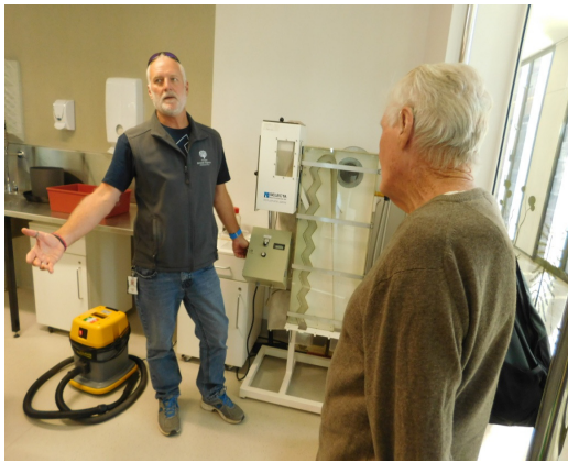
Left & Right Views of the Seed Processing Room