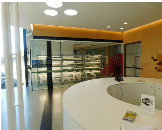
Left The entrance to the PlantBank