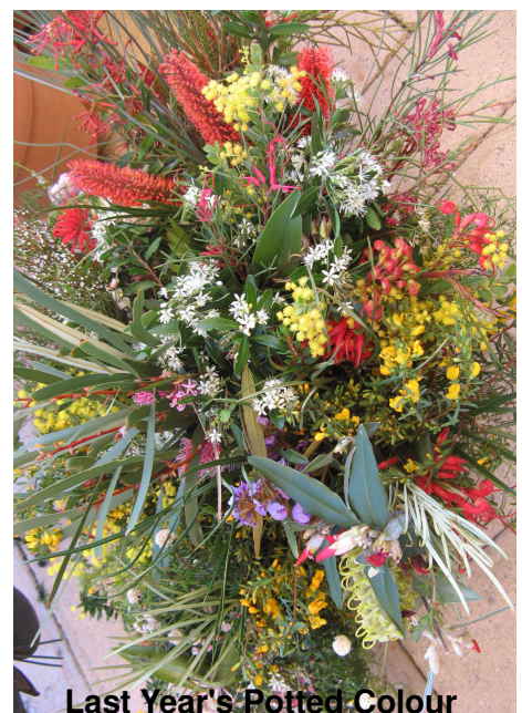
Last Year's Potted Colour

Your help will be greatly appreciated and will reduce the time to complete the work at Gumnut Hall.