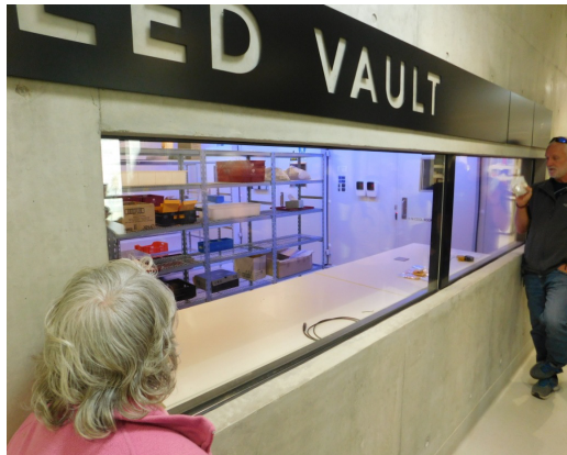
Left View of the Seed Vault