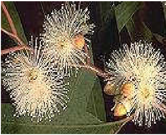
Eucalyptus parramattensis (Calgaroo)