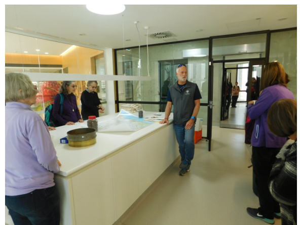
Right Meeting our Guide