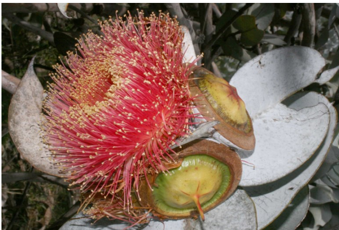
Eucalyptus macrocarpa has the largest gumnut of all the Eucalypts

This image is taken from the newsletter of the Friends of Burrendong Botanic Garden and Arboretum to which members of our Group travelled on two or three occasions about 30 years ago to assist in its development. APS Sutherland Group contributed more and some others may have helped too.